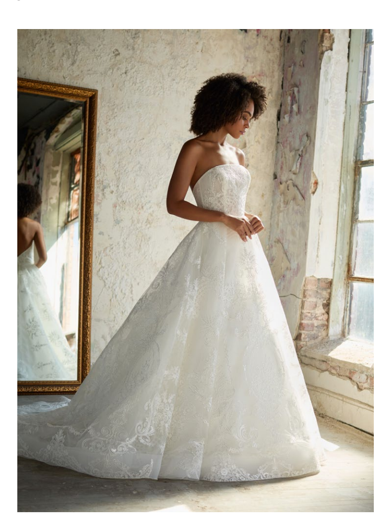
N • 13

Ivory fleur-de-lis embroidered tulle ball gown, strapless horizontal neckline, sheer embroidered corset bodice with natural waist, circular A-line skirt, chapel train. Matching lace jacket with long sleeve.