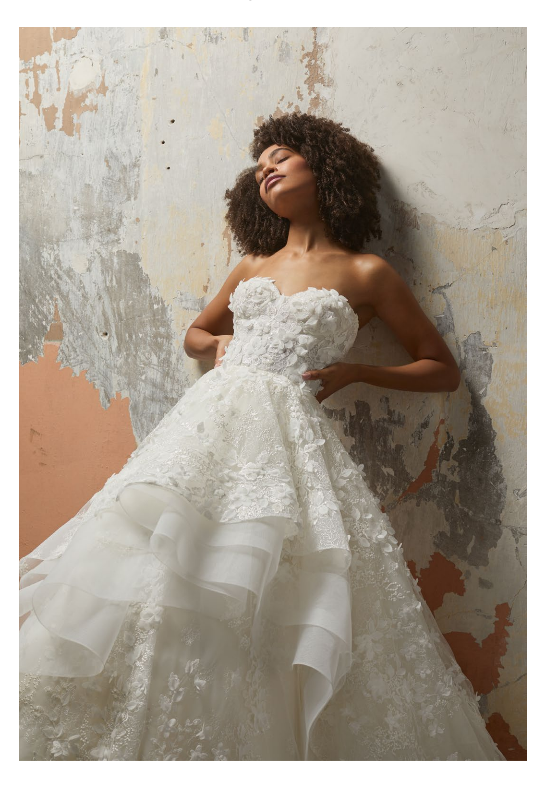
N • 10

Ivory floral embroidered ball gown, strapless sweetheart neckline, corset bodice with natural waist, asymmetrical layered waterfall skirt trimmed with horsehair, chapel train.