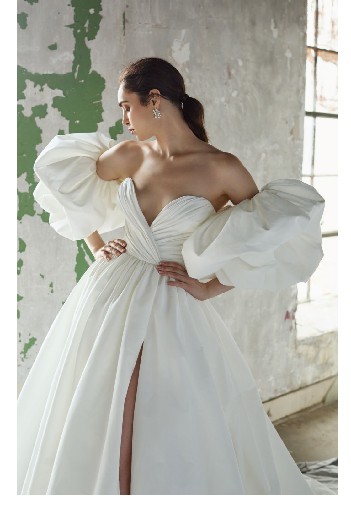
BACALL STYLE 32206