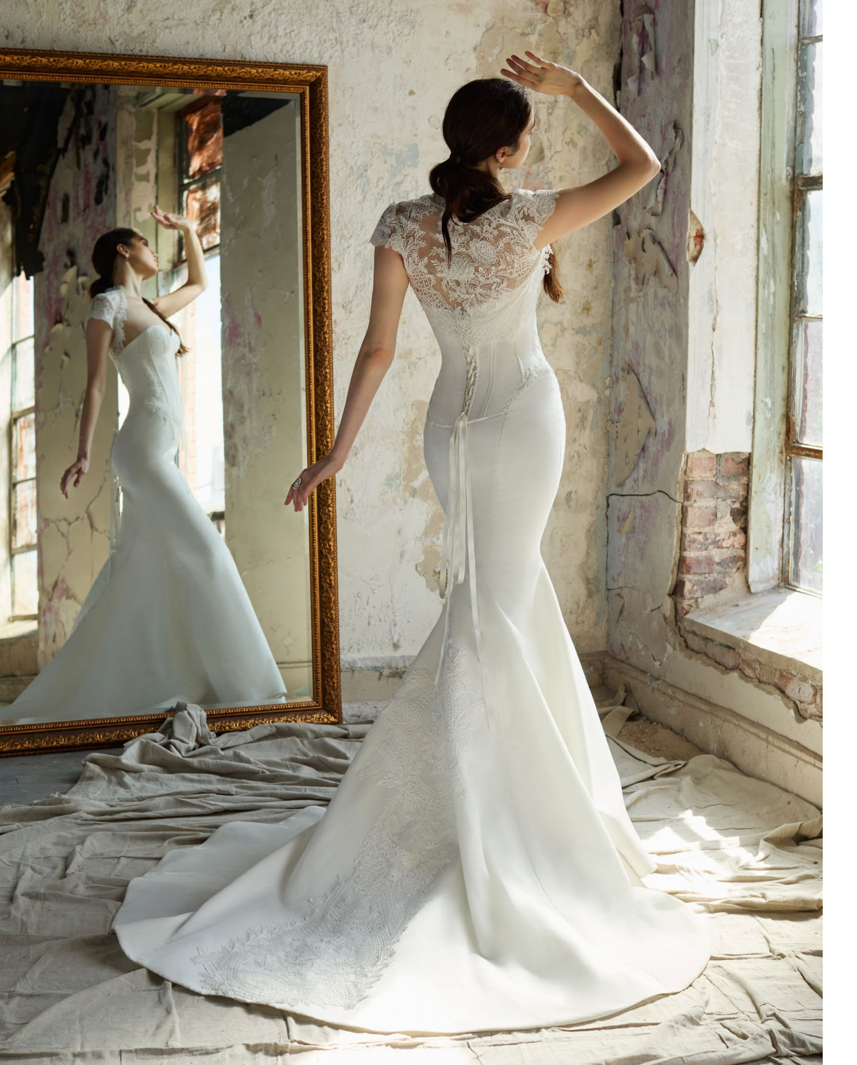
AVRIL STYLE 32207