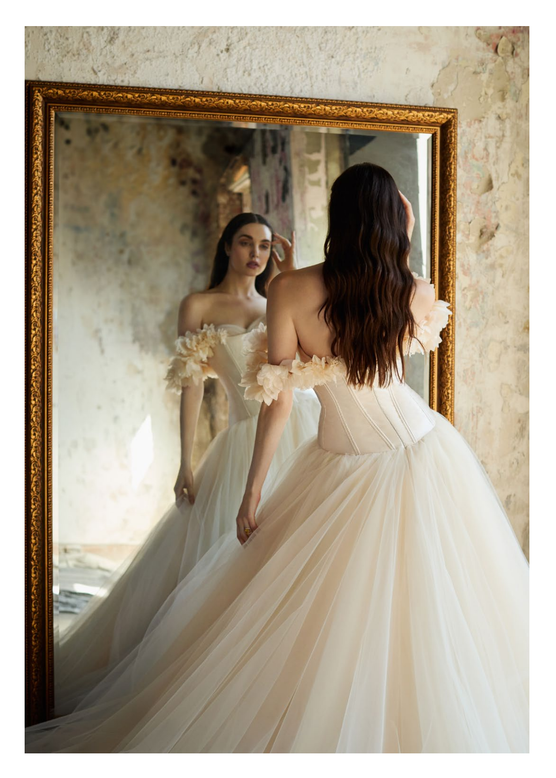
N • 01

Petal tulle ball gown, curved neckline and shoulder adorned with floral corsage, BMW silk satin French corset bodice, drop waist, gathered tulle skirt, chapel train. Circular chapel veil with scattered silk petals