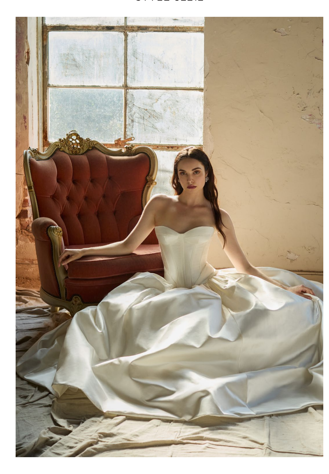
N • 14

lvory BMW silk satin ball gown, strapless curved neckline, French corset bodice with drop waist, gathered skirt with side pockets, chapel train. Circular chapel length feather veil with raw edge